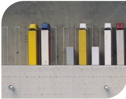
Transport and Logistics