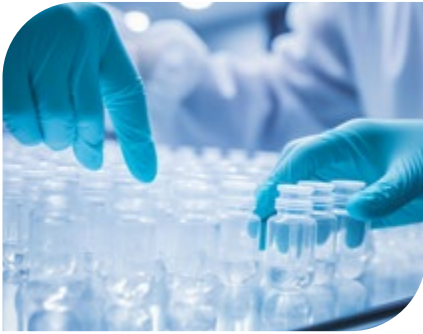
Chemical and Pharmaceutical Industries