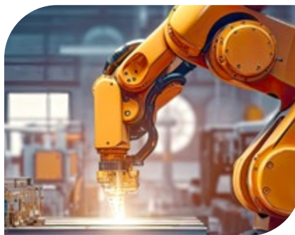
Machinery and Equipment Manufacturing