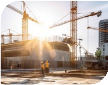
Real Estate and Construction Industries