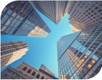
Banking and Financial Services