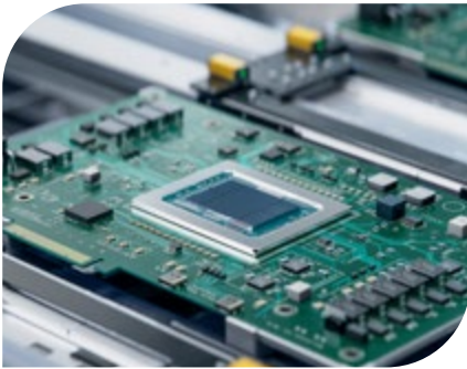
Software and IT