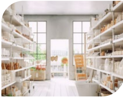
Consumer Goods Industry