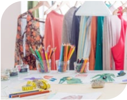
Textile and Clothing Industries